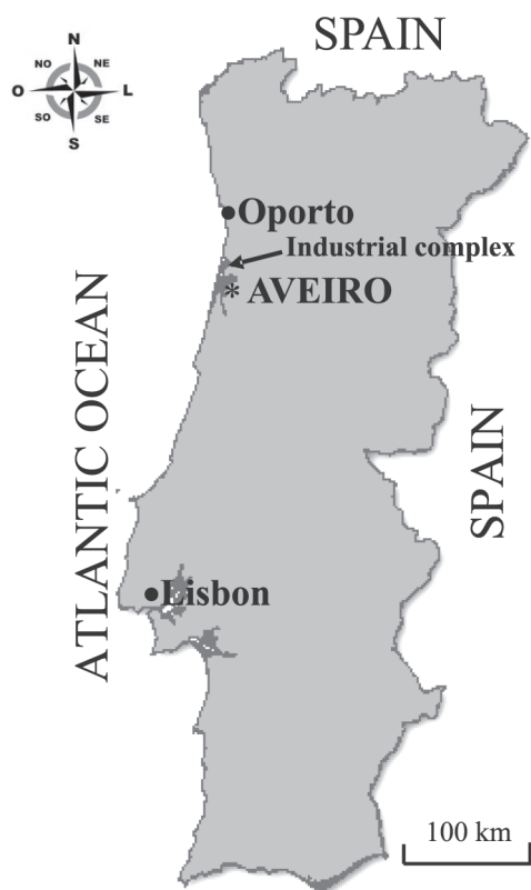
Figure S1. Map of Portugal showing the location of the sampling site, AVEIRO

Departamento de Ambiente e Ordenamento, Centro de Estudos do Ambiente e do Mar, Universidade de Aveiro, Campus de Santiago, 3810-193 Aveiro, Portugal