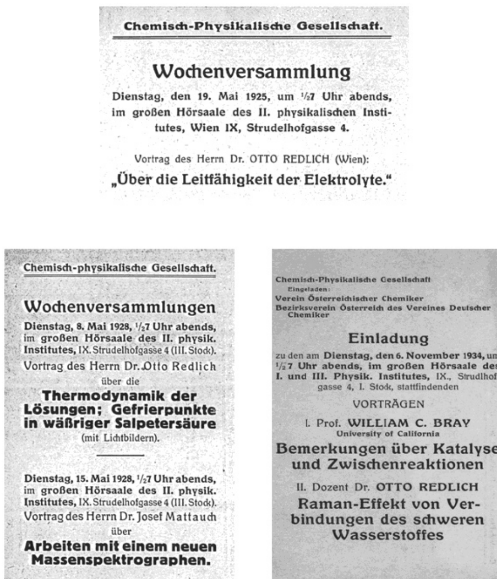
Figure 1S. Different announcement cards for Otto Redlich's early seminars in Vienna between 1925 and 1934.

Escuela de Ingeniería Química, Universidad del Valle, A. A. 25360 Unicentro, Cali - Colombia