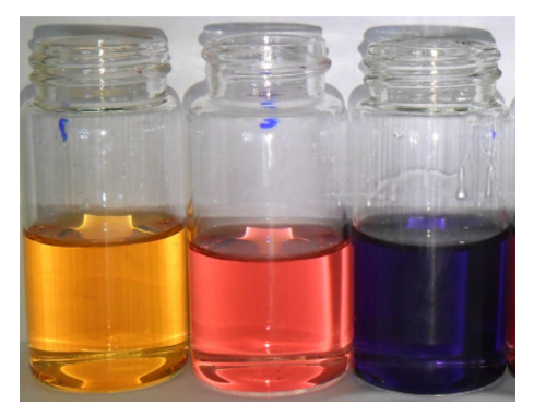
Figure 1. Color variation of solutions of 2 in solvents with decreasing polarity. From left to right: ethanol ( \lambda_{max} 466 nm), 2-propanol ( \lambda_{max} 494 nm), dimethylformamide ( \lambda_{max} 587 nm)

The variation of the charge-transfer band of dye 2 with the solvent is readily visualized in Figure 1. The solvent polarity decreases in the order ethanol > 2-propanol > dimethylformamide such that the charge-transfer band of 2 exhibits a red or bathochromic shift as the polarity of the medium is reduced (i.e., negative solvatochromism).