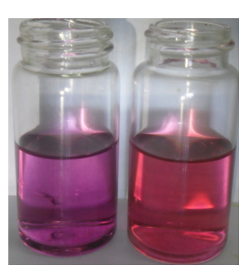
Figure 3. Cationic halochromism of dye 2 in acetone when increasing amounts of NaI are added to a 3-mL solution of the dye. From left to right: 1 mg ( \lambda_{max} 537 nm) and 8 mg ( \lambda_{max} 514 nm) of NaI added