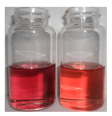
Figure 4. Color change of a solution of 2 in 2-propanol when cooled in ice water (left) and when placed in a hot-water (70–80°C) bath (right)

The variation in color of two solutions of 2 in 2-propanol at different temperatures is shown in Figure 4 as a demonstration of the thermochromism of the dye.